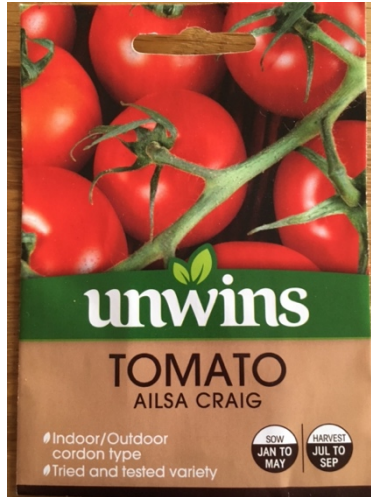
Tomatoes Alisa Craig

You will have received one of three types of tomato and one of two types of lettuce, so all types are included here. The type should be indicated on your seed packet.