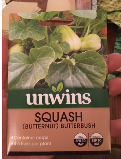
Winter squash 1